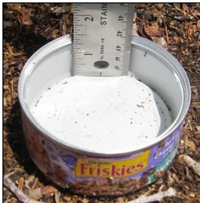
Cat food, tuna fish, soup or vegetable cans can be used to measure the amount of water a hose-end sprinkler puts out.

Test your soil with a screwdriver blade. If it doesn't go in 6 to 8 inches into the soil it's time to deeply water.