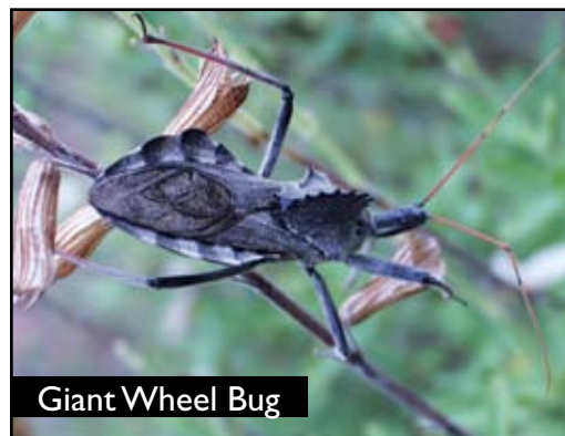
Giant Wheel Bug