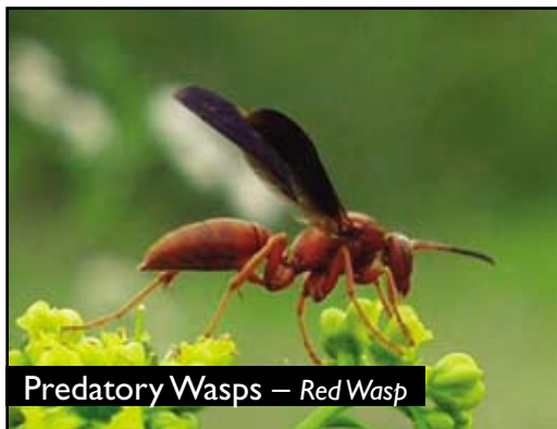
Predatory Wasps – Red Wasp