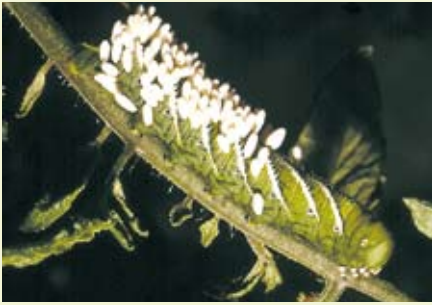
Parasitic wasp pupae on a tomato hornworm