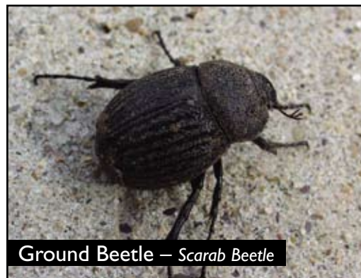
Ground Beetle – Scarab Beetle