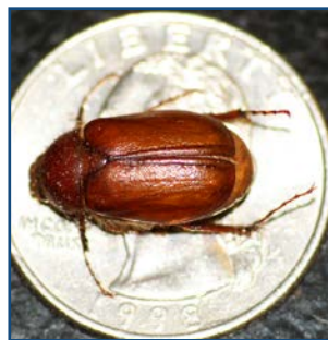
Figure 2. Phyllophaga crinita adult beetle.