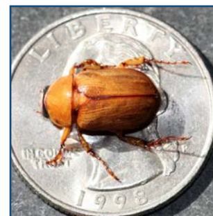
Figure 3. Southern masked chafer ( Cyclocephala lurida ) adult beetle.