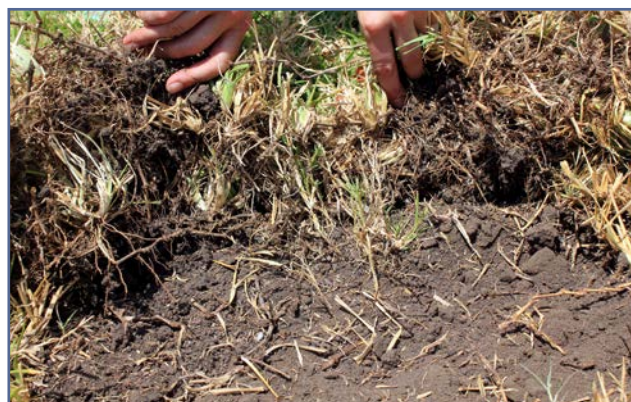
Figure 4. White grub damage to turfgrass roots.

lawns, or athletic facilities adjacent to wooded areas. As with many insect pests, prevention is a critical component of effective white grub management.