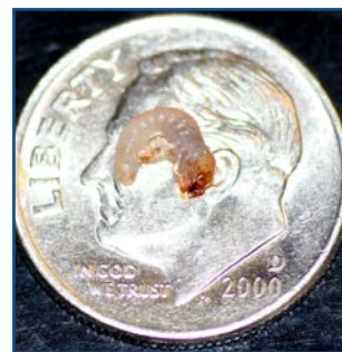
Figure 6. May/June beetle 1st instar white grub.

Most of today's white grub preventative insecticides have relatively long persistence in the soil; however, applications made too early may break down before white grubs are present. To avoid treating too early, it is usually best to put out an insecticide after the June beetle mating flights have ended. Effective prevention products include the active ingredients chlorantraniliprole, cyantraniliprole, clothianidin, imidacloprid, or thiamethoxam. There are also combination products that contain bifenthrin mixed with clothianidin or imidacloprid. Although these treatments can provide some control after damage appears, they are most effective if applied early.