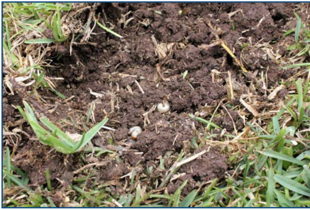
Figure 7. Before treating, search for white grubs in the turfgrass to make sure they are causing the problem.

To confirm that white grubs are the reason for yellowing or dying patches of turfgrass, dig up some small sections on the edge of dying grass (Fig. 7). If grass pulls up easily and has few roots, and there are five to ten grubs per square foot, then treatment may be justified. Late season treatment products may include carbaryl, chlorpyrifos, dinotefuron, lambda-cyhalothrin, or trichlorfon. However, unlike the preventative treatments listed above, these products have relatively short residual activity after application.