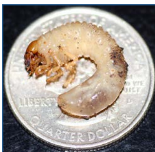
Figure 1. May/June beetle 3rd instar white grub.

W hite grubs (Fig. 1) are the larval stage of scarab beetles, also known as May/June beetles or chafers. There are over 100 species of May/June beetles in Texas, but only a few species cause damage to turfgrass. Those species include May/June beetles, Phyllophaga crinita and Phyllophaga congrua , as well as the southern masked chafer, Cyclocephala lurida (Figs. 2 and 3). White grubs feed on the roots and other belowground portions of warm-season turfgrasses, such as bermudagrass, zoysiagrass, buffalograss, and St. Augustinegrass. They also feed on cool-season turfgrasses such as fescues, bluegrasses, and ryegrasses. Visible damage includes irregularly shaped patches of dead turfgrass that may resemble symptoms of drought stress. In severe cases, damaged turfgrass can often be rolled up like a carpet (Fig. 4). Secondary damage may also occur when skunks, raccoons, and armadillos dig through the turfgrass in search of grubs to eat. Such damage may be particularly severe on golf courses, home