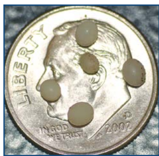
Figure 5. May/June beetle eggs.

It's important to note that between March and June several other species of scarab beetles may also emerge in large numbers and be attracted to windows and lights. Although related to the June beetle, these early-emerging beetles do not damage turfgrass, though a few may temporarily defoliate trees and other plants. No treatments should be needed for these beetles.