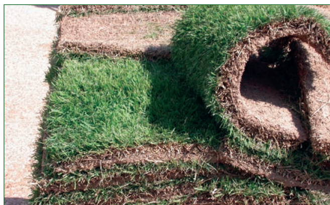
Figure 2. Sod pieces stacked on a pallet awaiting installation.

Sod has traditionally been sold by the square yard, though the trend now is to sell it by the square foot. To determine the amount of sod you will need, measure the square feet of the area to be planted, then divide the total square feet by 9 (the number of square feet in a square yard) to calculate square yards. There are 111 square yards per 1,000 square