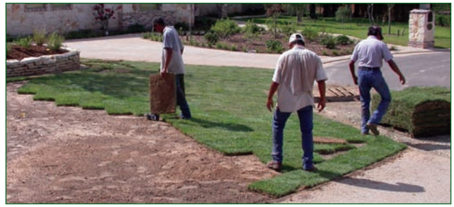
Figure 4. Sod installation.

Sodding. The firm soil surface should be free of footprints, stones, depressions and mounds. Sod is perishable and should be installed within 36 hours of harvest. If you see mildew or yellow grass leaves as you pull the pieces off the pallet, it is evidence of “sod heating” injury, which happens when sod is left on the pallet too long. Do not plant such sod.